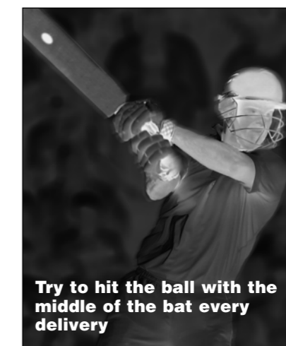
Try to hit the ball with the middle of the bat every delivery