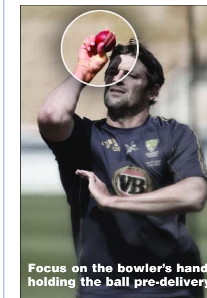
Focus on the bowler's hand holding the ball pre-delivery