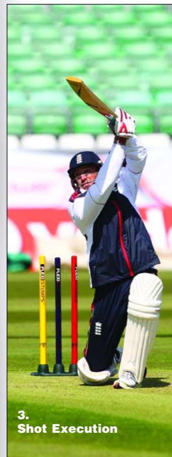
3. Shot Execution