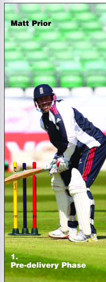
1. Pre-delivery Phase