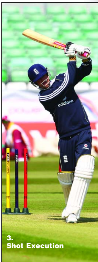
3. Shot Execution