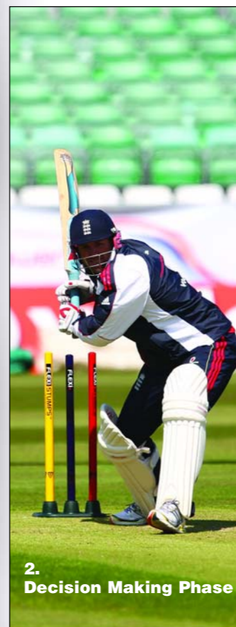
2. Decision Making Phase