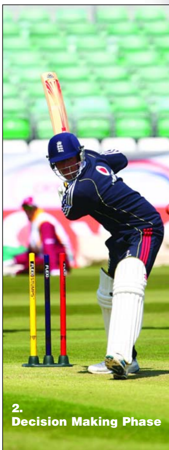
2. Decision Making Phase