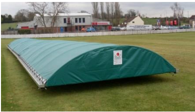
Mobile Cricket Covers 3 units £3,850 + vat including delivery and Installation*

Durant Cricket are now offering the following prices to NatWest CricketForce members on our wide range of cricket ground equipment and Daktronics LED cricket scoreboard's. Order now for delivery in 2011 to beat the VAT increase!