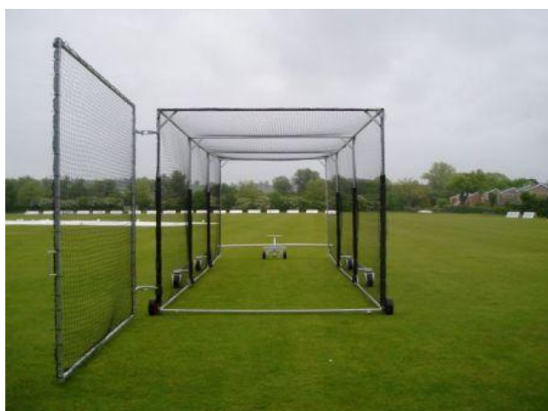
Premier 10m Mobile Cage

Products include Mobile Covers, Sight Screens, Cages & Nets plus bespoke items and other equipment, which is all built to order in our factory in Cambridgeshire.