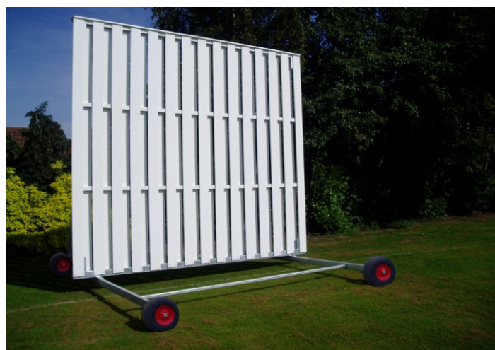
Club 'Classic' Sightscreen - 2 for £1950 (exc. VAT, delivery and installation)

Order and pay before 31.12.10 to beat the VAT increase! We will hold the goods at our factory for delivery at the start of the season.