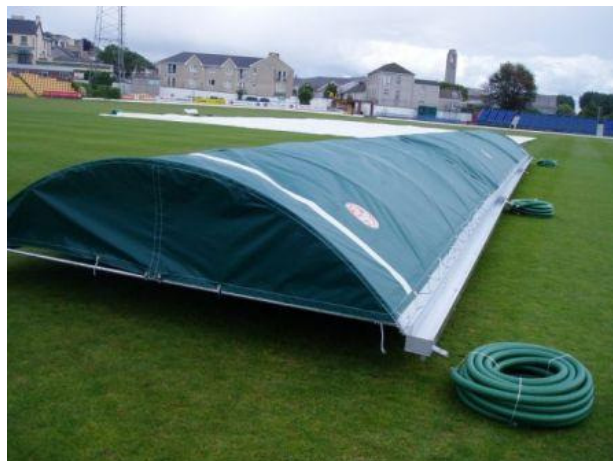
Premier & Club Dome Covers

We have over 30 years manufacturing experience and specialise in providing equipment that is strong and built to last and to customers individual requirements.