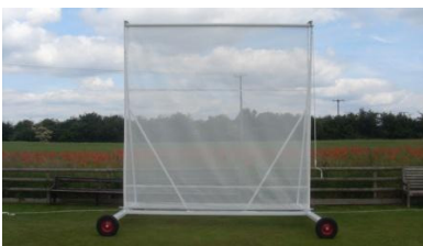
Mesh Sight Screen 4m x 4m £850 + vat*