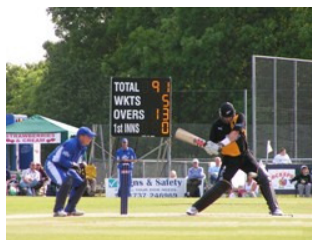
CR2002 £2120 + vat*