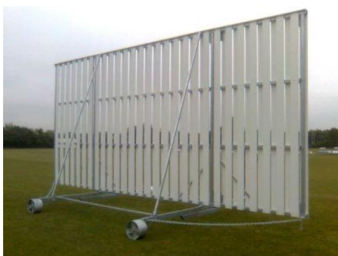
Premier 8m Folding Sightscreen

We offer all NatWest CricketForce registered clubs great deals and discounts on our products – contact Johnjac for prices and information on 01354 610353 or email: info@johnjaccricketsupplies.com .