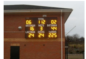
CR2003 £3840 + vat*