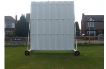
PVC Sight Screen 4m wide x 4.5m high £1,050 or 2 for £2,000*