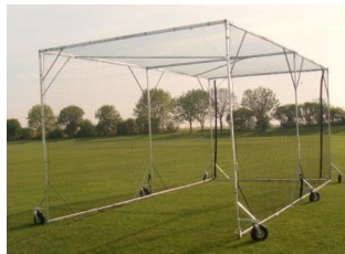
Mobile Cricket Cage 7.2m long £1,200 + vat*